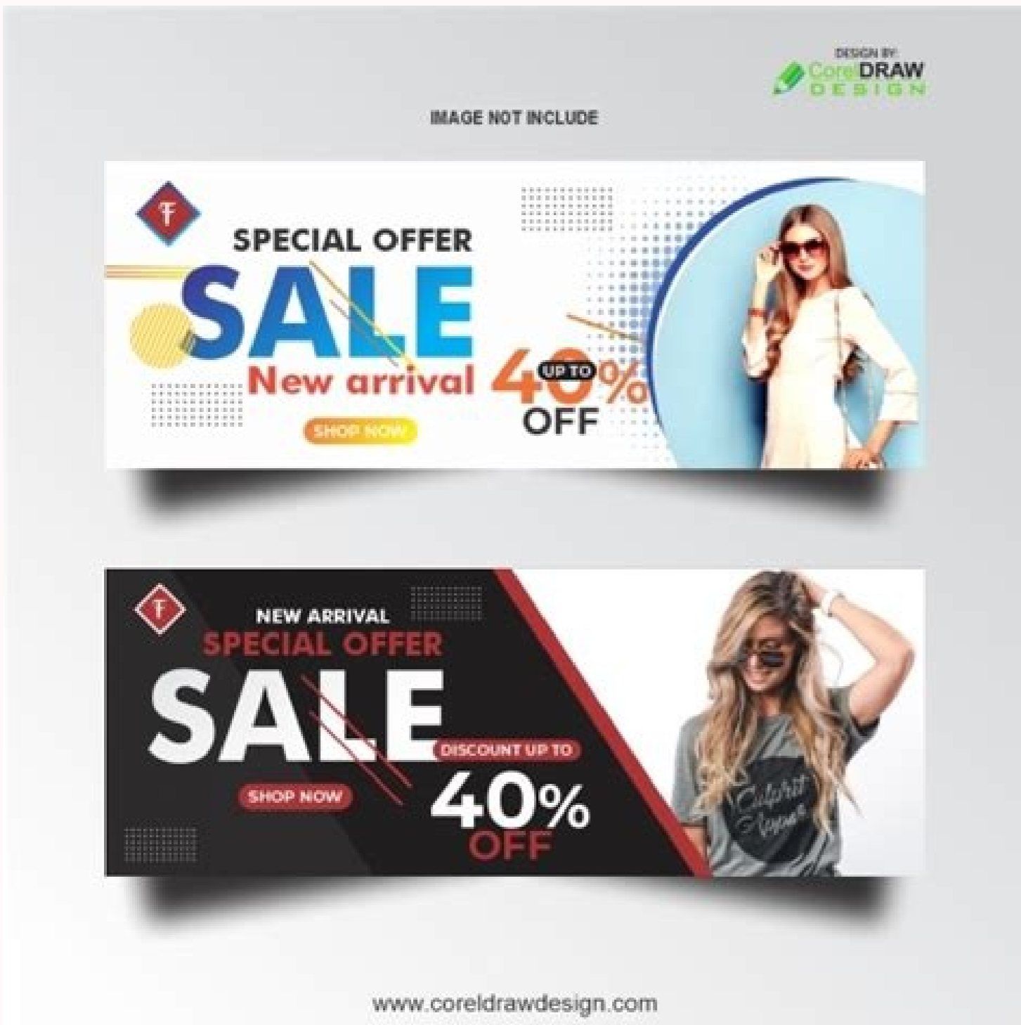
Coreldraw cdr file design download. Coreldraw wedding card design cdr file free download. Mẫu file coreldraw cdr cho dân design. Coreldraw banner design cdr file download. Coreldraw cdr file design free download. Coreldraw background design cdr file.